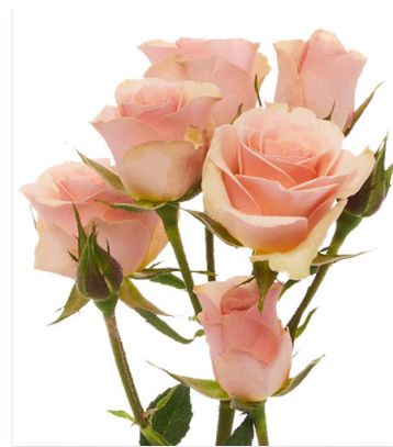
Spray Rose Ilse