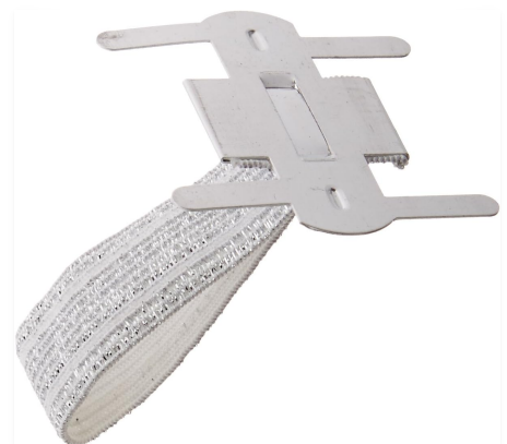
Elastic Wrist Corsage Band