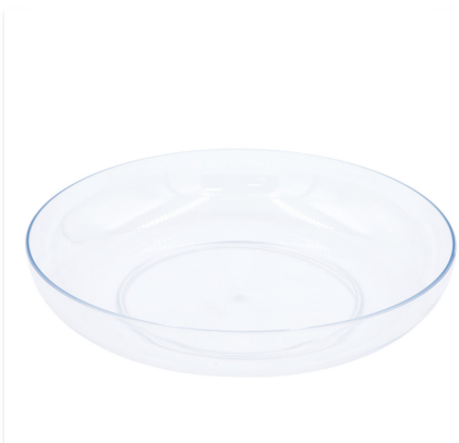
Lomey Dish 6"