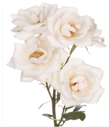
Spray Rose Majolika